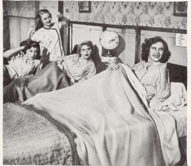
"Girls' School" Mat 2-A; Still No. 35